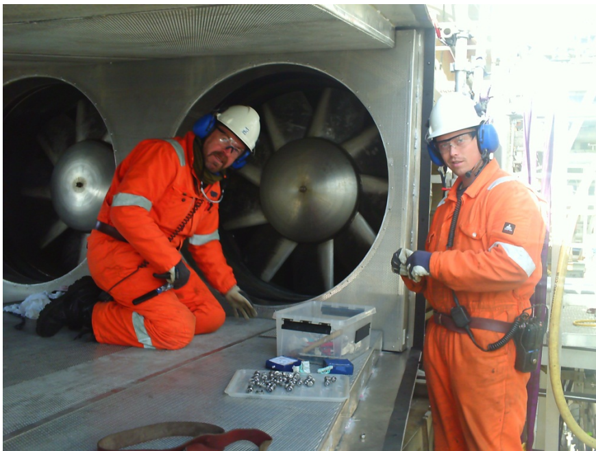
Visund 4 tr. Compressor ventilation inlet system – RS11